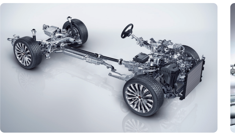
Luxury Chassis with Longitudinal Rear Drive

Eliminate journey exhaustion. Free to change your sitting position and relax the body.