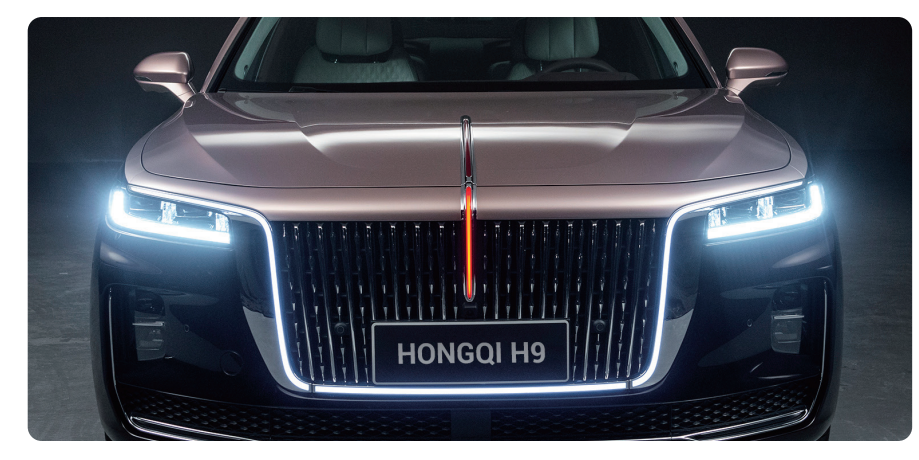
"Wings of dream" front greeting lights

More than 67.7% ultra-high strength steel sheet with "9h" structure creates super strong body which protects safety of driver and passengers.