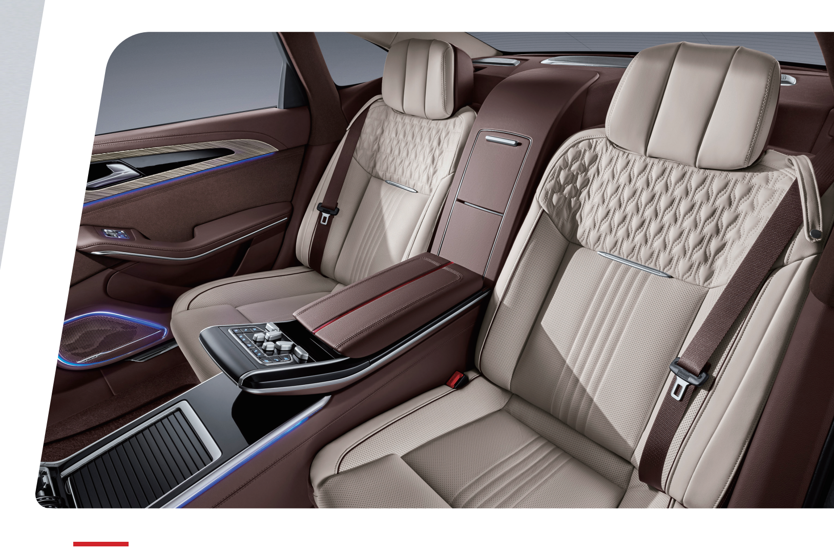
Luxury Rear Seats with Multi-Function Control

Eliminate journey exhaustion. Free to change your sitting position and relax the body.