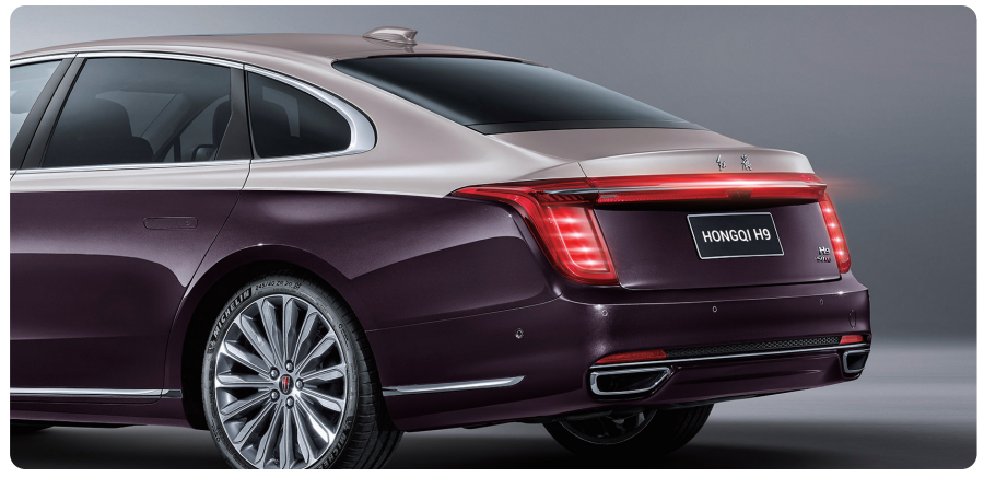
"Wing of Beidou" LED Tail Lamp