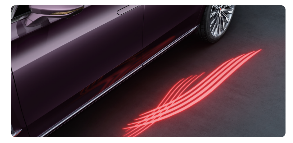
Exclusive Honorable Lighting "Wings of Hongqi" greeting lights.