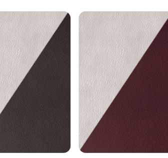
Grey+Lvory white Red+Lvory white