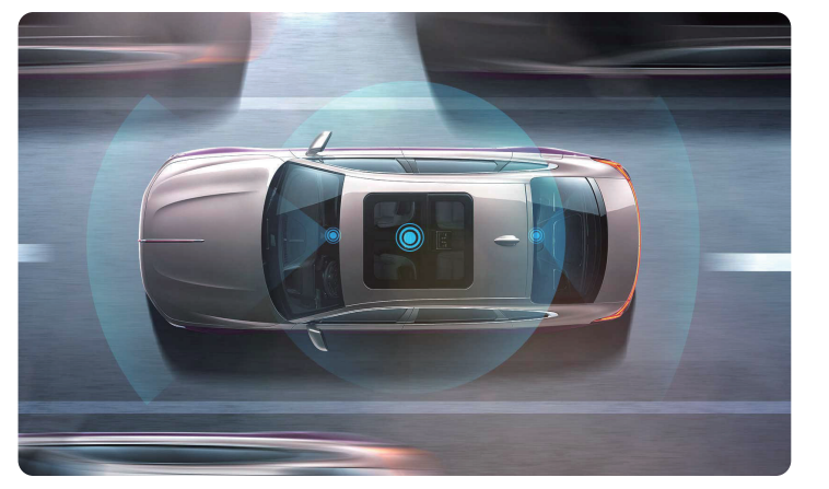
Large-size high-solution WHUD and streaming media rearview mirror create 360 degree all-round protection and worry free driving.