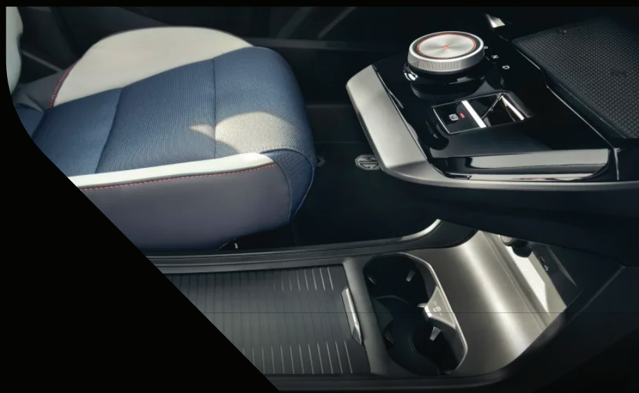
28 GENIUS STORAGE SOLUTIONS