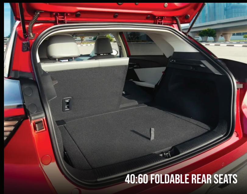
40:60 FOLDABLE REAR SEATS