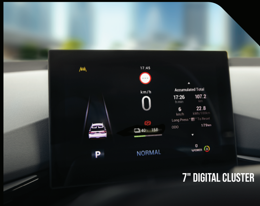
7" DIGITAL CLUSTER

Stay connected on the go with the MG 4 Electric's advanced technology. Features include a Bluetooth key, and a 10.25" touchscreen for seamless integration with your smartphone through Apple CarPlay and Android Auto. The car also has a 360° camera system, providing real-time parking assistance and reducing blind spots for safer manoeuvring. The ADAS display and gear display offer intuitive access to vital driving information. Integrated multi-functions support online services, navigation, music, and weather, keeping you informed and entertained throughout your journey.