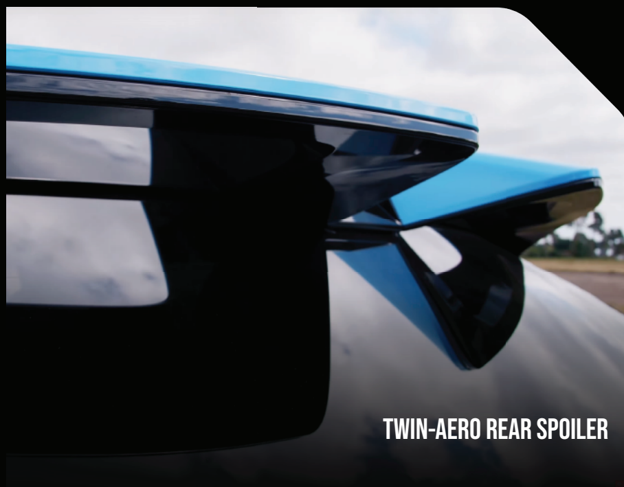
TWIN-AERO REAR SPOILER

The MG 4 Electric features a future-focused design that guides its stunning exterior. Its nimble, flowing two-tone roof adds a layered visual presence, while unique LED headlights and a dual-wing spoiler with high-mounted brake lights enhance its agile appearance. The U-shaped active intake grille not only adds to the sleek design but also improves cooling efficiency. Along with the carbon-fibre effect diffuser and multi-layered rear end, these elements create a bold and dynamic look that turns heads wherever it goes.