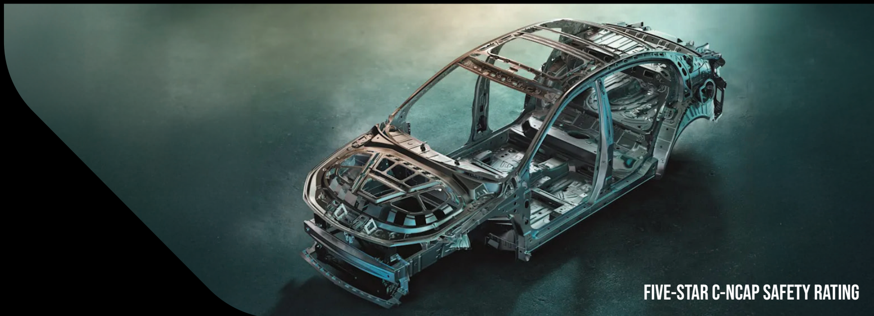
FIVE-STAR C-NCAP SAFETY RATING