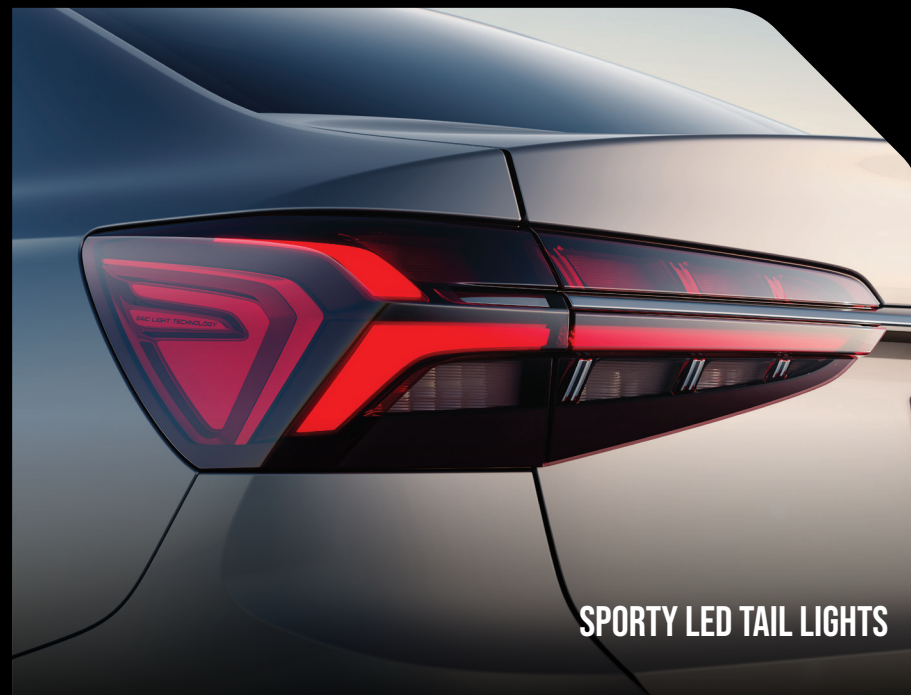
SPORTY LED TAIL LIGHTS

The MG 5 is designed to catch the eye and perform with precision. With a refreshed front fascia and rear end complementing its sleek design, -the MG 5 is built to impress. LED headlights lead the way, while the aerodynamic profile keeps you ahead of the curve. From the clean lines that trace the body to the refined details, every inch of the MG 5 is crafted to leave a lasting impression as you drive by.