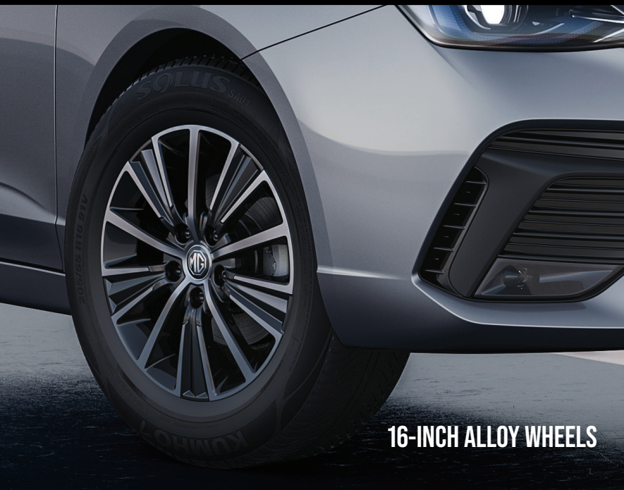
16-INCH ALLOY WHEELS