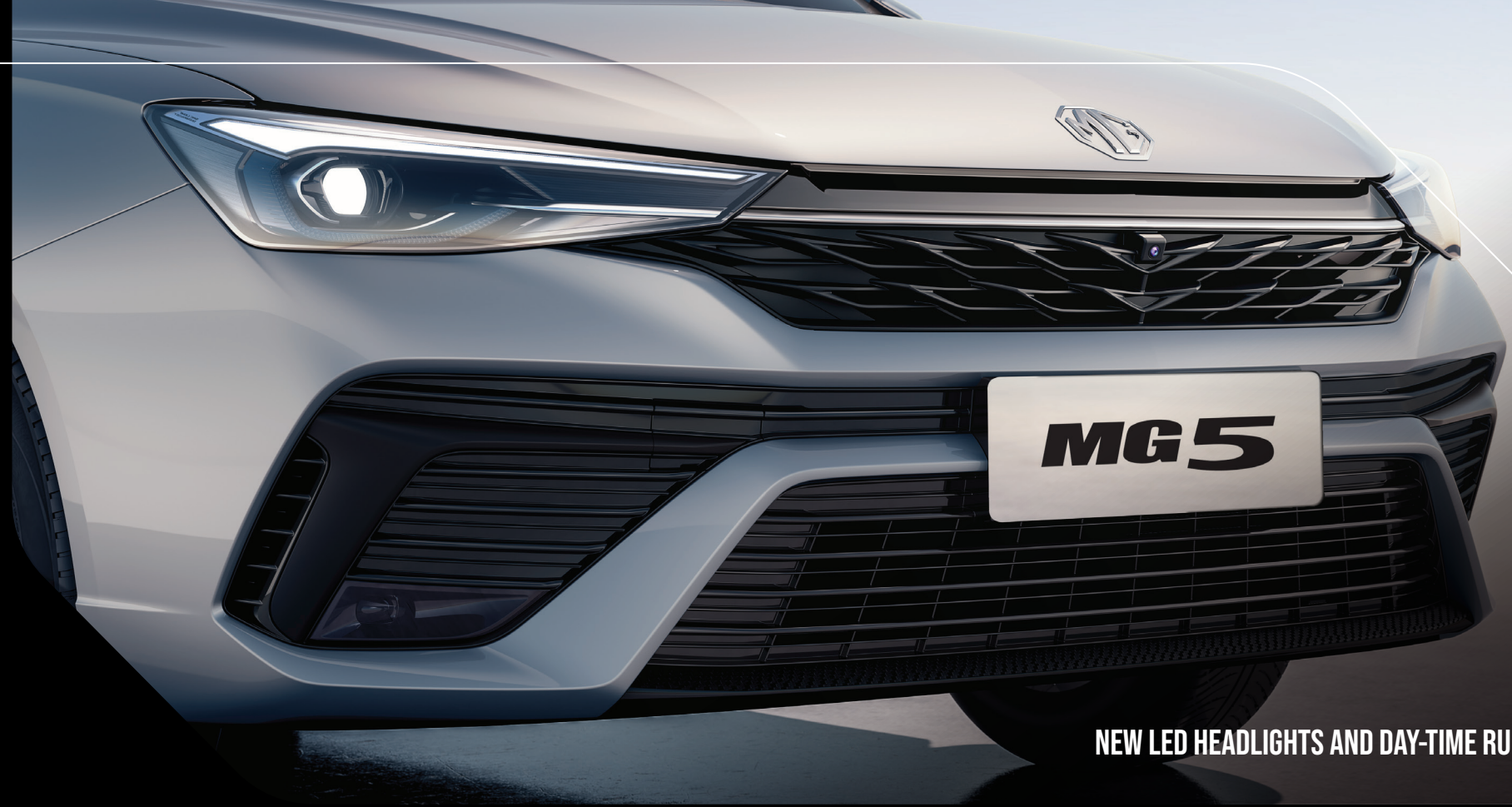
NEW LED HEADLIGHTS AND DAY-TIME RUNNING LIGHTS